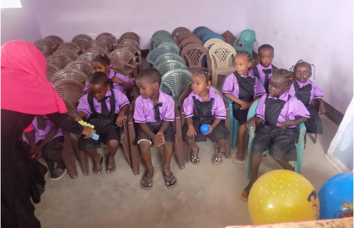
Purchased uniforms and toys